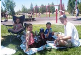
"Fun Day" at the Nevada State Veteran's Home